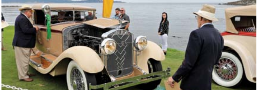
Pebble Beach Concours d'Elegance adopted the ICJAG forms and guidelines in the 1990s

As experience and knowledge is gained, the judging at such shows will only get better. In addition to field judging, ICJAG holds training seminars in several countries and has a mentoring program for young judges. ( Visit www.icjag.org for more infor mation. )